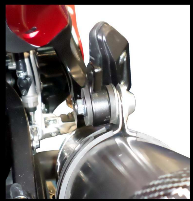
Silenziatore destro Right silencer